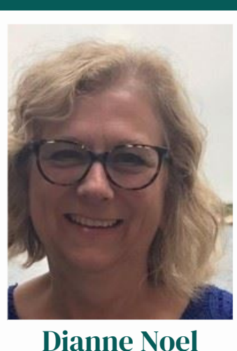
Book Club Co-Lead